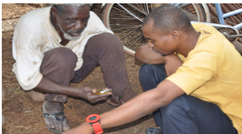
CEA (right) delivers Android based agricultural extension message to a farmer at Manguli kukuo

Eighty one (81) communities located in 12 districts in the Northern Region have CEAs who interact with 10 pre-selected farmers every week either at their homes or farm to deliver audio and video format extension messages. These messages are delivered to the farmers using Android phones after a real time needs assessment was conducted. The target farmers are gradually adopting the recommended extension messages.