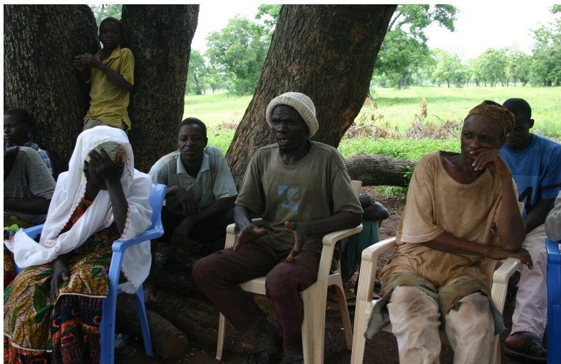
CEA target farmers in Focus Group Discussion with MoFA District Directors

MoFA play very important roles as far as DIRTS CEA program implementation is concerned. The Agricultural Extension Agents (AEAs) of MoFA aid in providing assistance to CEAs when they are technically challenged in addressing questions of farmers during their interactions with target farmers. In the month of September, the DIRTS CEA Team embarked on separate field visits with various MoFA District Directors for them to observe how the CEA extension messages were delivered to the farmers in their respective districts. Among the activities that characterized most of the visits by the