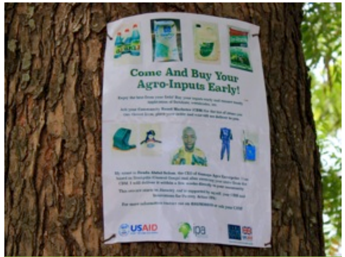
A poster with input dealer contacts was placed in each DIRTS community

The first round of input orders from 60 DIRTS communities ended in mid February. Sales records show that weedicides were the best selling inputs making up a total of 89 percent of the orders by farmers, followed by fertilizers, and then all other items.