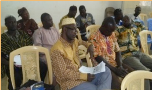
Agro-input Retailers explore ways to improve sales in 2015 farming season. Tamale, January 12 th , 2015

During the same workshop, the DIRTS team and retailers reviewed and updated the agro-input catalog for 2015, which now includes around 120 products (fertilizers, weedicides, insecticides, storage chemicals, certified seeds and other equipment).