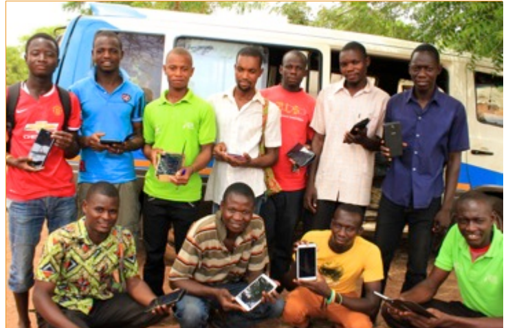
Group of CEAs pose of a picture after testing their new Android devices at a practice run. Botanga, Northern Ghana

The training combined lecture-style sessions and field visits to a demonstration field to teach the CEAs best practices in the cultivation of maize and legumes. CEAs were also given Android devices with a large screen for better visualization of the extension videos during interactions with farmers. CEAs were trained to use these new devices and taken to the communities for practice runs.